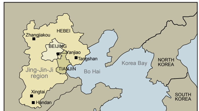
Source: News.com.au Image Processing: Bay Area Council Economic Institute