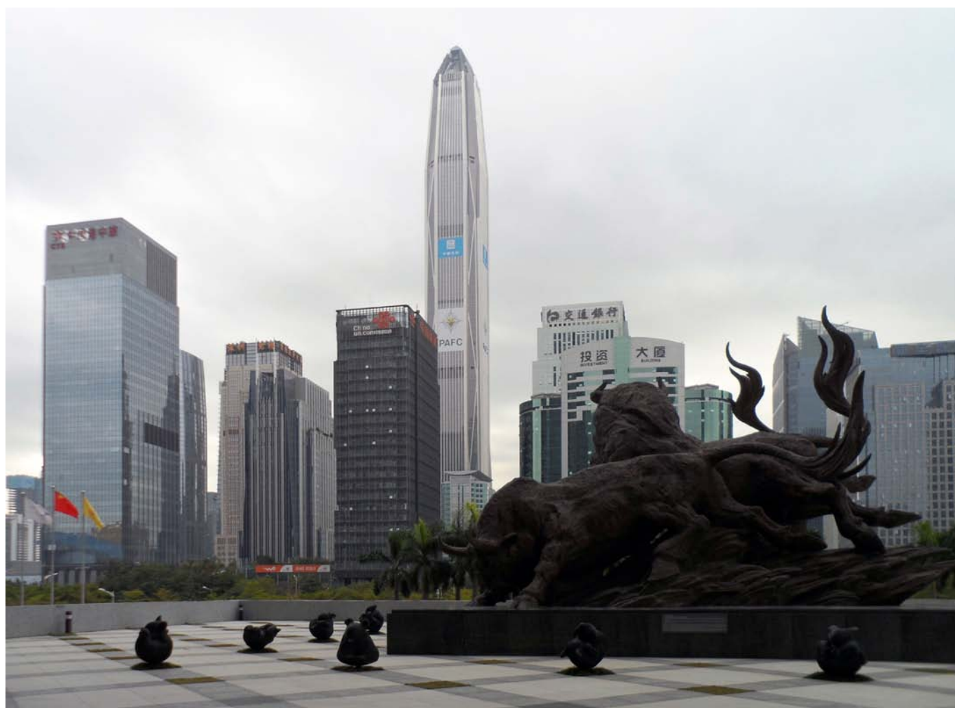
View from the Shenzhen Stock Exchange