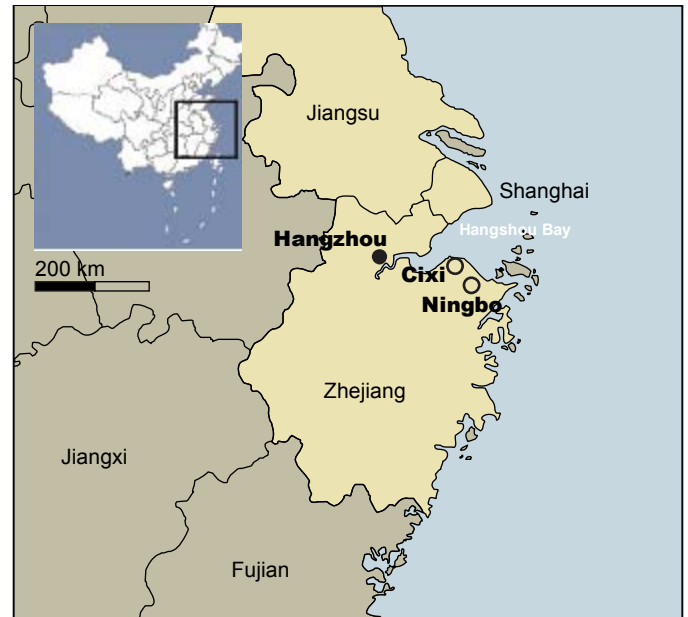
Source: Su Jingbao / China Daily Image Processing: Bay Area Council Economic Institute

The focus of this report is to analyze the economic and innovation potential of the GBA project in the context of recent global trends and to examine synergies with the Silicon Valley/San Francisco Bay Area that might facilitate collaboration beyond the longstanding relationships the region already enjoys with China and with Hong Kong in particular.