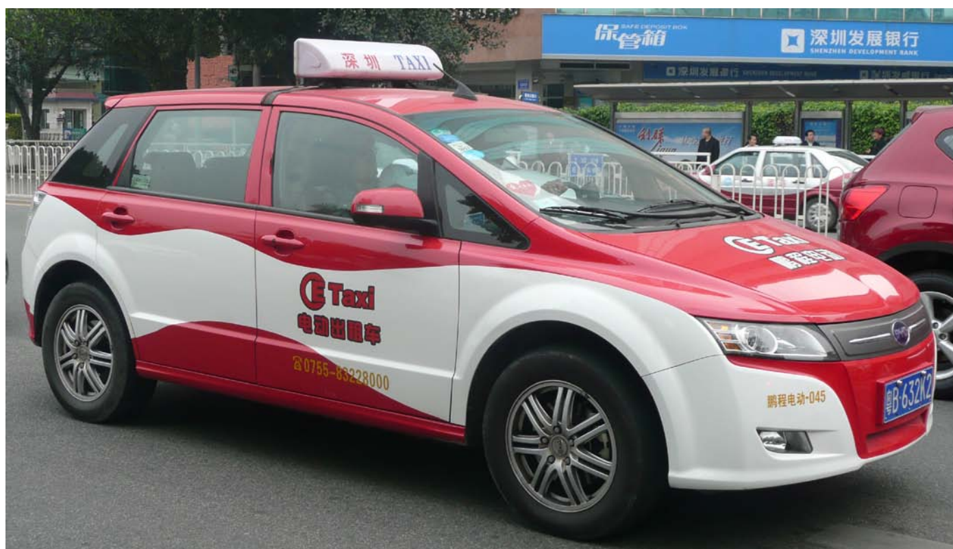
BYD electric taxi in Shenzhen

Currently, NEVs make up only 5% of China's new car market, but the government has set a goal requiring that all new cars sold in the country after 2035 be new energy vehicles, with 50% of new cars sold being either electric, plug-in hybrid, or fuel cell vehicles, and 50% being conventional hybrids. In addition, China plans to gradually eliminate non-hybrid gas-powered vehicles, with the goal that 75% of gasoline cars will be hybrids by 2030, 100% of them will be hybrids by 2035, and manufacturing of non-hybrid gas-powered vehicles will have ended by 2035. 52