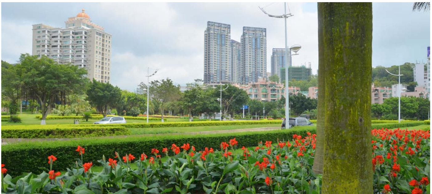
Crossroads greenspace in Zhuhai

This pairing of capabilities—Shenzhen and Hong Kong via Qianhai and Macao with Zhuhai through the Hengqin Free Trade Zone, with both tied to Nansha's and Guangzhou's significant industrial and technology base through the PRD's transportation infrastructure—is designed to stimulate the development of a world-class city cluster, as well as to anchor southern China in the Belt and Road Initiative.