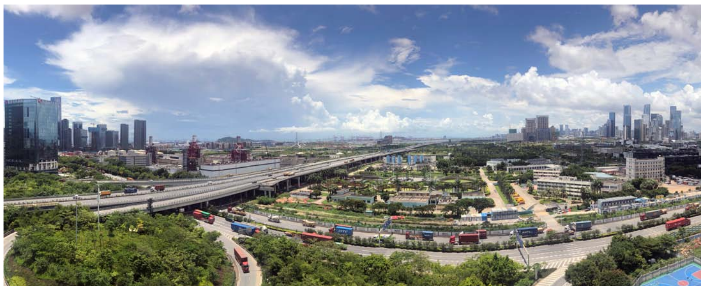
Qianhai-Shenzhen-Hong Kong Modern Service Industry Cooperation Zone

Development of Qianhai is phased across 22 "units" defined by rail and other public transport stations. Each unit will feature residences, commercial space, and amenities designed for livability and shorter commutes, often by foot or bicycle. Three broad "areas" fronting the bay facing west—Guiwan, Qianwan, and Mawan—will