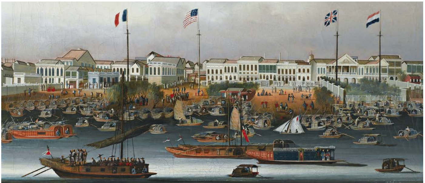
Port of Canton, circa 1830

The PRD was central to China's "reform and opening up" launched by Deng Xiaoping in 1978—which first opened China to foreign investment and allowed private business ownership, and later privatized some state-owned enterprises and lifted price controls. Shenzhen, created as one of China's first four Special Economic Zones in 1980, became the laboratory for these reforms. This led to development of large-scale contract manufacturing for export, backed up by gateway financial services, logistics, transport, hospitality, commercial property,